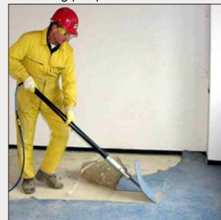
Loosening of soft floor coverings