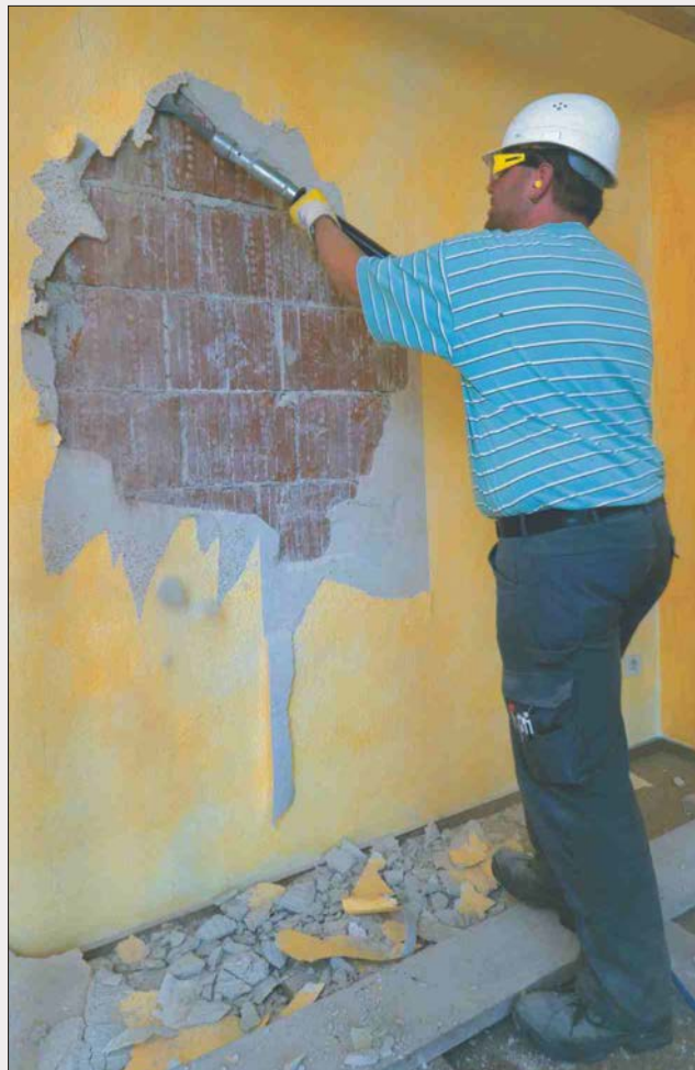
Removal of plaster - full height of a storey without scaffolding nor bending