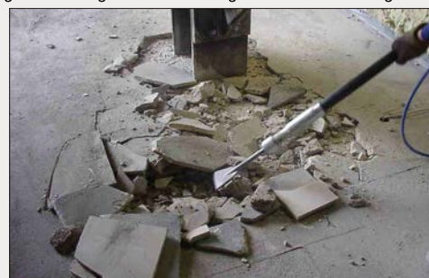
Forcing floor pavement open