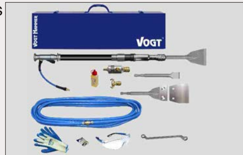
VOGT Basic Set for painters, plasterers, tillers...