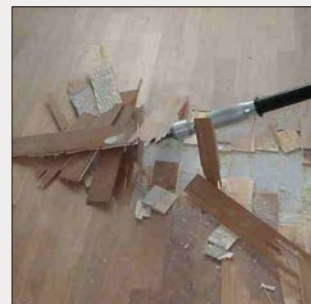
Detaching parquet and laminate