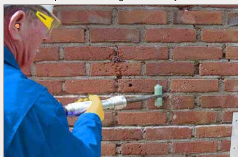
Opening joints in constant depth