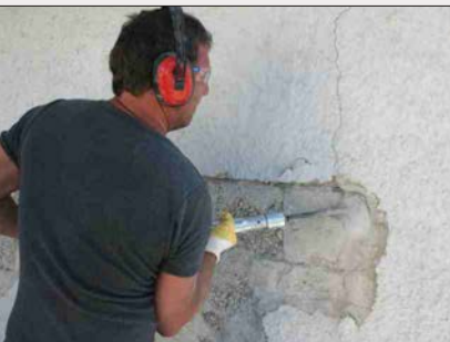
Striking off exterior plaster