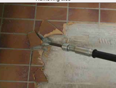
Breaking off tiles and plates